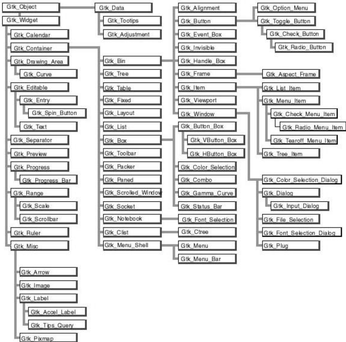
Figure 2.1: Widgets Hierarchy

It is important to be familiar with this hierarchy. It is then easier to know how to build and organize your windows. Most widgets are demonstrated in the testgtk/ directory in the GtkAda distribution.